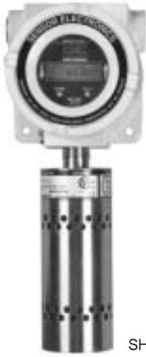
SHOWN WITH SEC MILLENIUM SENSOR